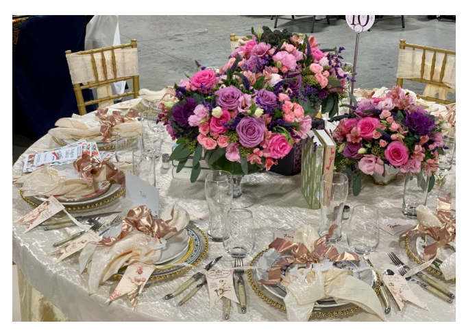
Table by Renee Bianco - Jane Austenland