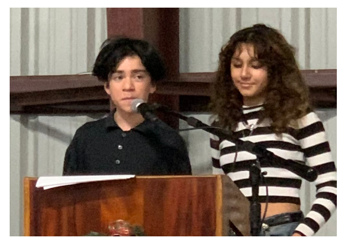
iLEAD Agua Dulce students presented their pitch in the Shark Tank