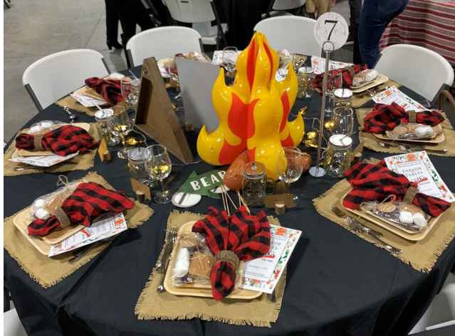
Above: Table by Gina Flanagan, Campout Left: Ultimate Skin Care - Table by Sandra Pacheco, Breakfast at Tiffany 's