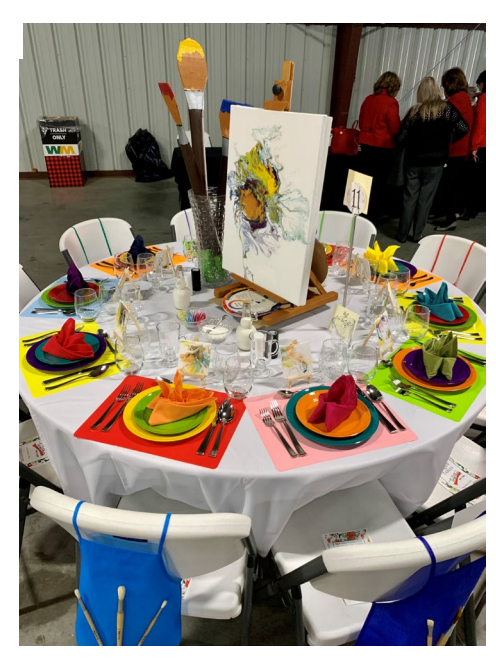
Table by Angela Phillips, Art Sur la Table