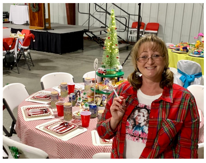
Table by Kela Nagel – Upper Class Trailer Trash Christmas