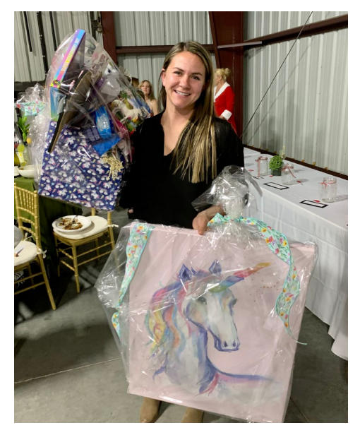
The raffle baskets are always a fan favorite at Parade of Tables. Just ask this lucky winner.