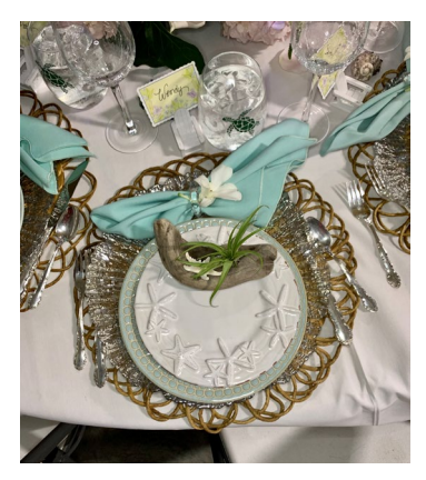
Table by Julie White, A Day at the Beach