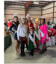
2023 Agua Dulce Royal Court