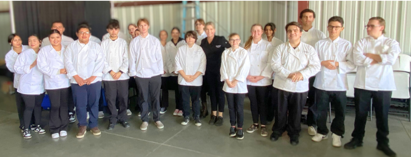
Lunch was catered by Kristina's Kreation s and served by Vasquez High School Culinary Arts Students

33201 AGUA DULCE CANYON ROAD, BOX #7, AGUA DULCE, CA 91390 (833) OUR-ADWC (687-2392) WWW.ADWC.ORG